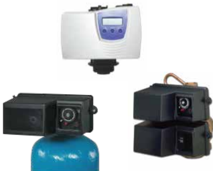
Fleck Valve - Multi Media Filter & Activated Carbon Filter Technical Features